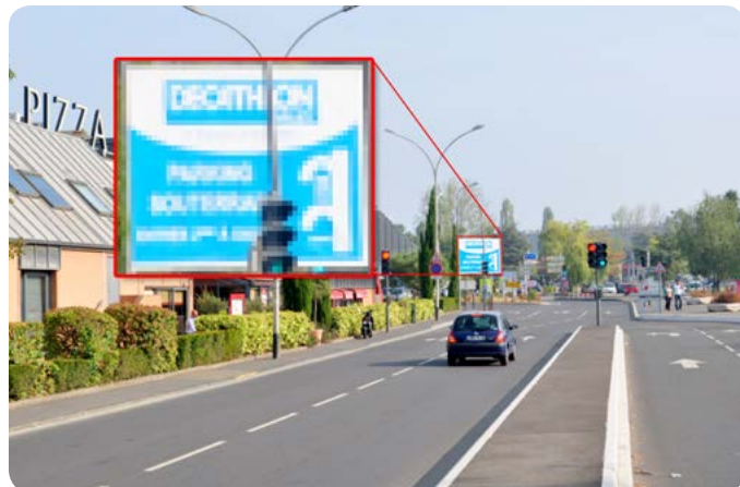
Conventional Analog Camera

The TVI Analog solution offers real-time HD video output at HD1080P / HD720P with maximum frame rate of 60fps. Analog users can now enjoy enhanced HD video quality images.