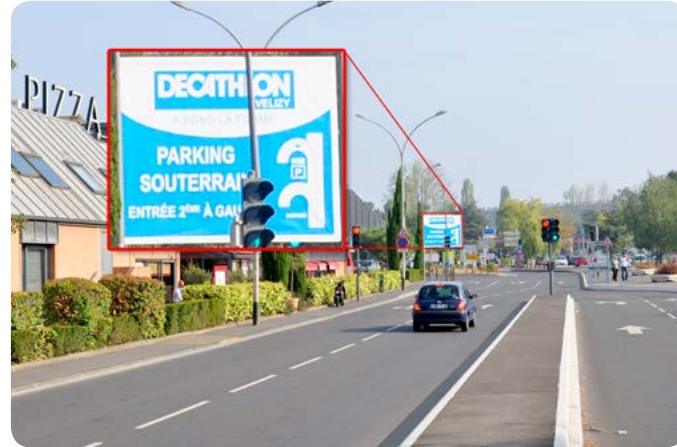
TVI Analog Camera